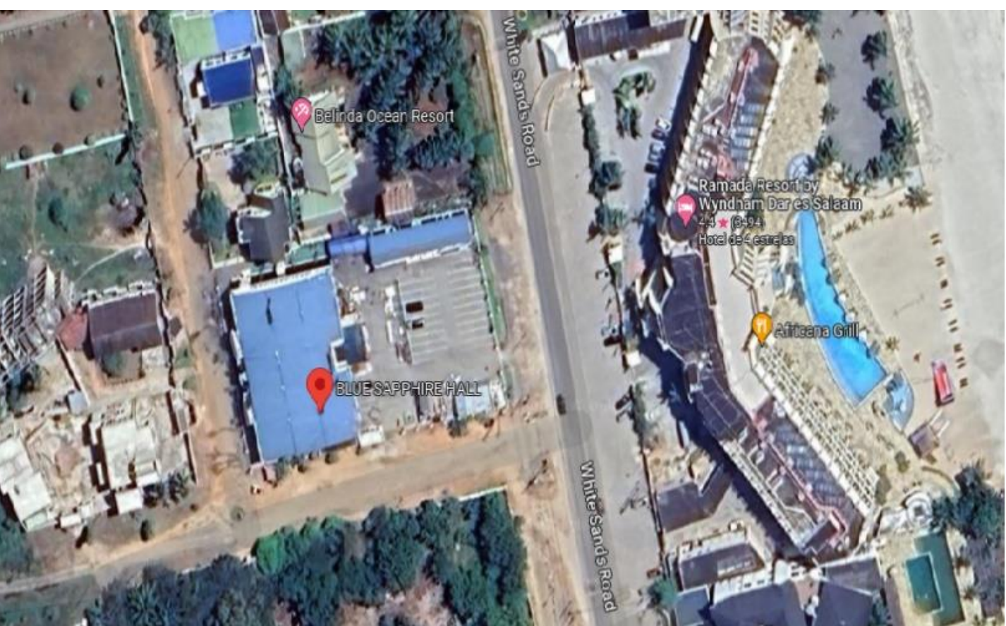
"Blue Sapphire Hall" location